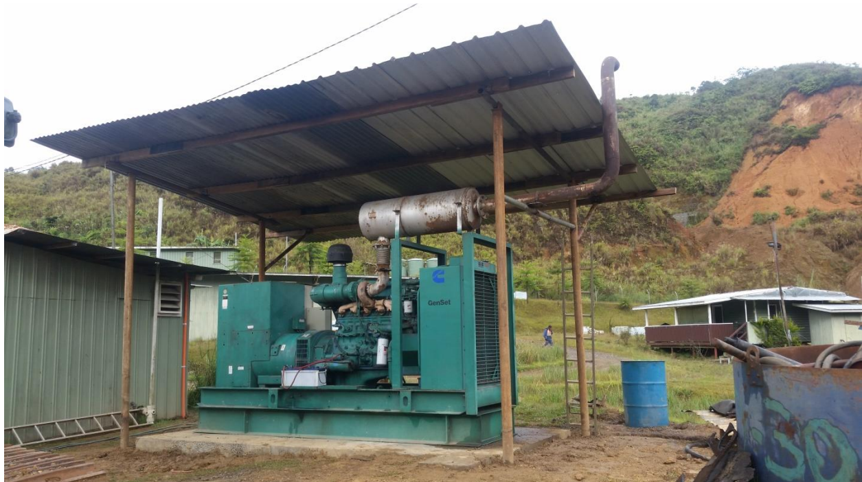
440kVA Cummins Genset installed during the quarter

A new PLC was installed into the Gekko ISP concentrator plant and following the failure of one Variable Speed Drive (VSD), a new VSD has been purchased, installed and successfully tested subsequent to Quarter-end.