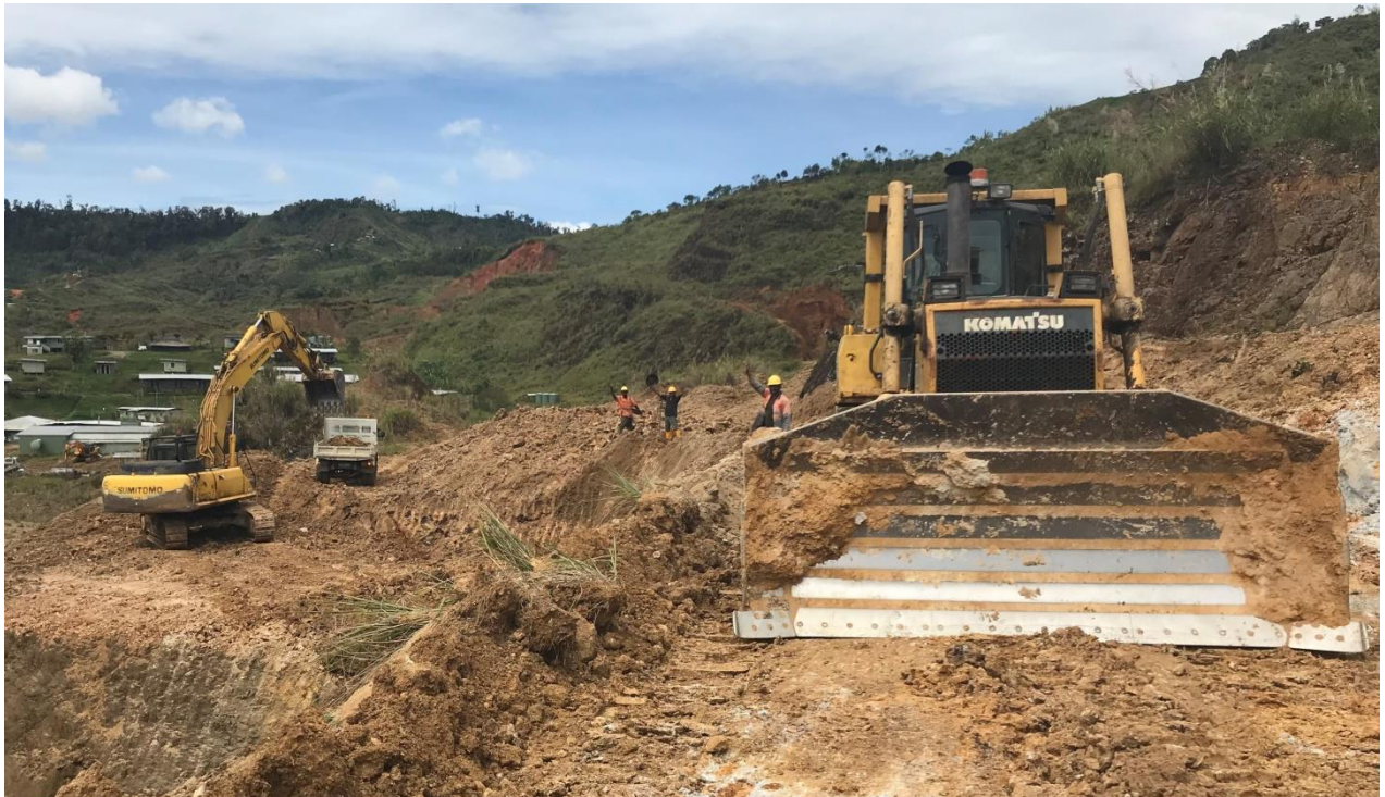
Ore being mined from Alpha West for stockpiling during the Quarter

Repair works were carried out on most mining plant items and negotiations were concluded in respect of the delivery of two more, second-hand Komatsu D85 bulldozers and a 40 tonne, articulated tip-truck from the Hidden Valley mine.